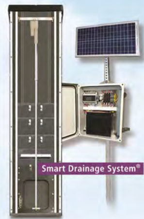
Smart Drainage System®

Call for a FREE catalog or visit our website to view our full line of products.