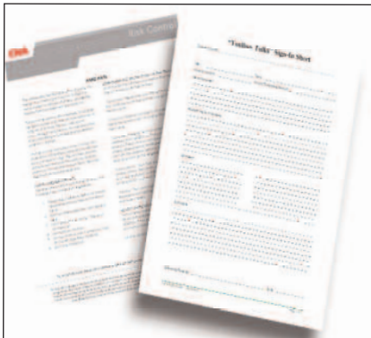
Thirty Tool Box Talks

A complete CD of the manual is included. To obtain your free updated copy contact the LICA office.