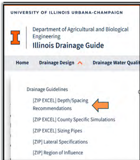
Figure 2. Location of Revised Depth/Spacing Recommendations Routine on the Main Page of the Illinois Drainage Guide.