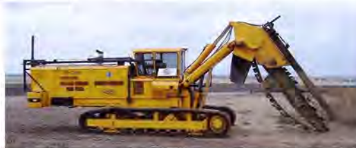
The Inter-Drain chain trencher. Four size choices, mechanical or hydraulic chain drive, vertical and offset available. Cummins, Volvo or Cat power.