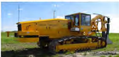
The Inter-Drain plow, three types, double link, single cantilever, or single link, each in three sizes. Cat, Cummins or Volvo power. Offset available.